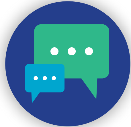
Communication & Family Support