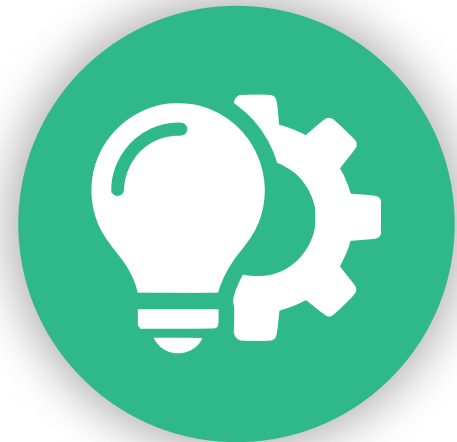
Innovation & Technology