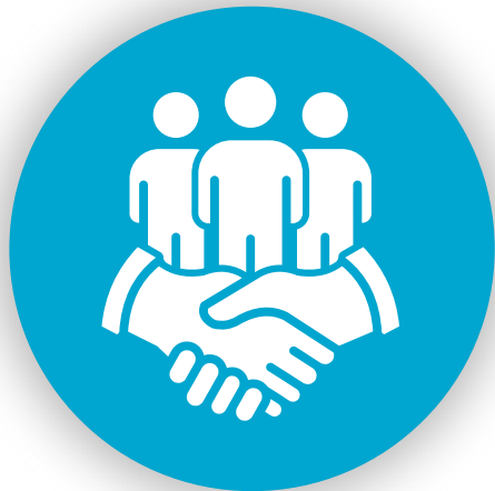
Partnership & Community