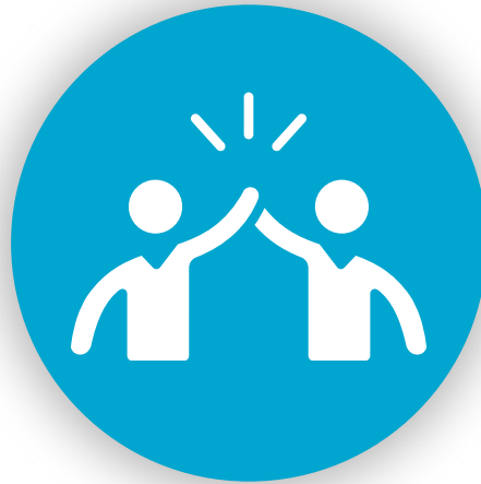
Training & Staff Wellbeing