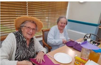
Everyone has been hard at work making bonnets for the parade